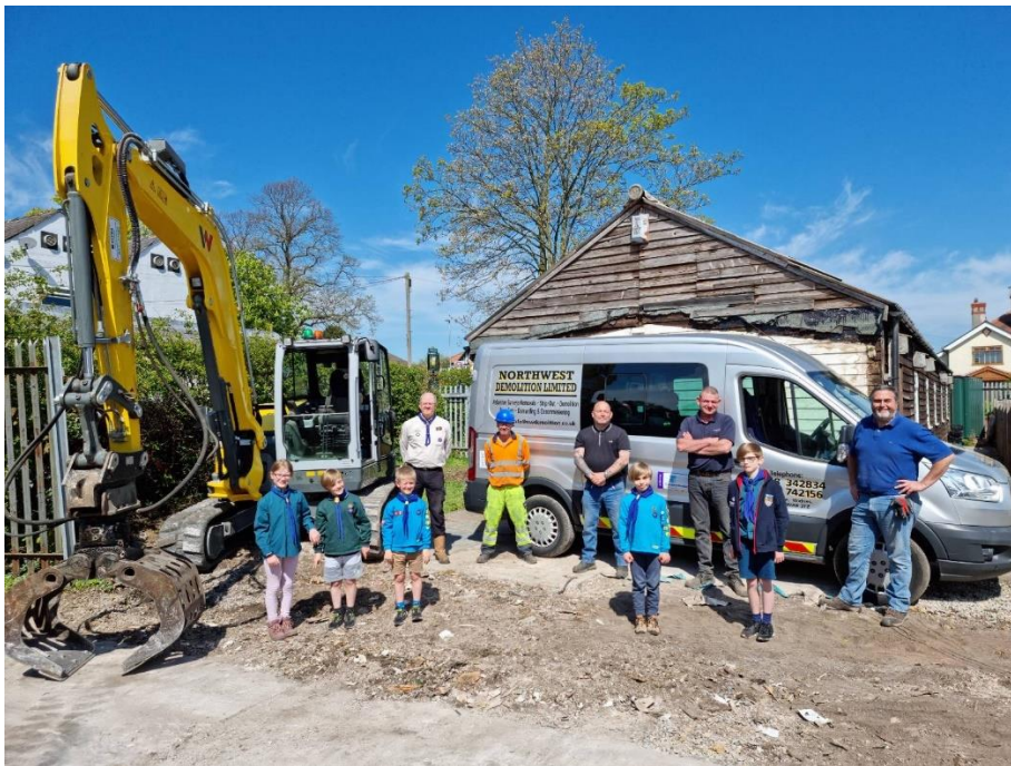
The old amenity block has been demolished to make way for the new one